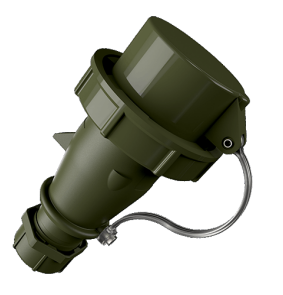
Part no. 24774